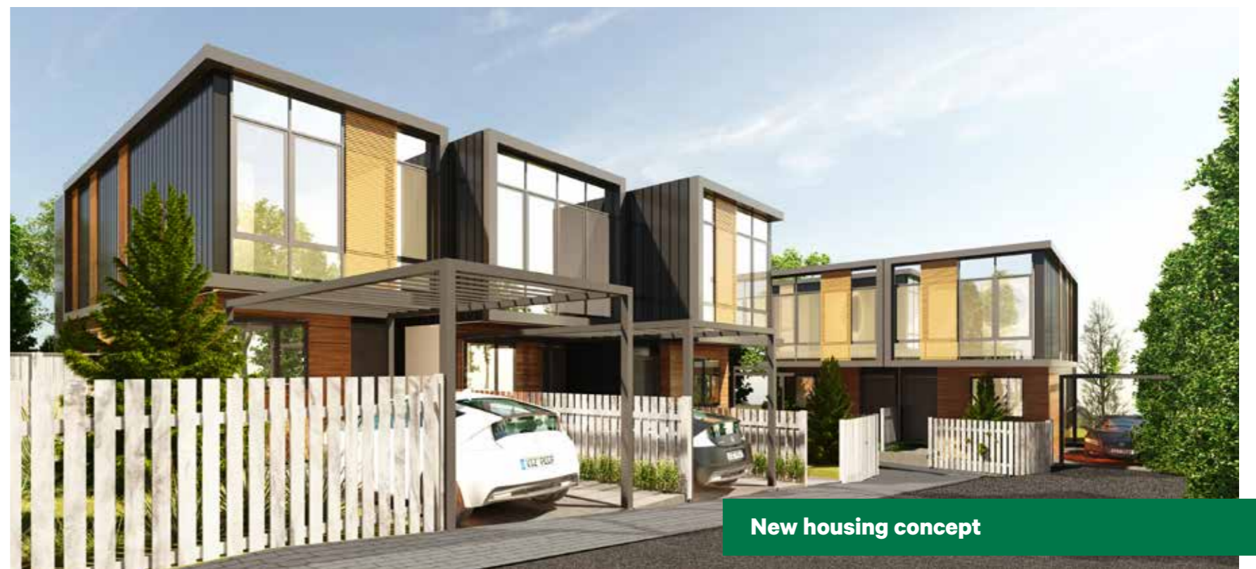
New housing concept