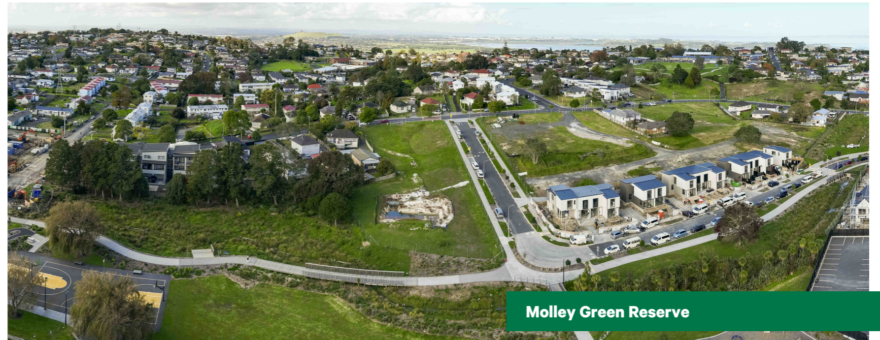
Molley Green Reserve

⋮ Kāinga Ora’s vision for the developments is to increase the supply and choice of new, high-quality housing, and to support and strengthen the communities as they grow.